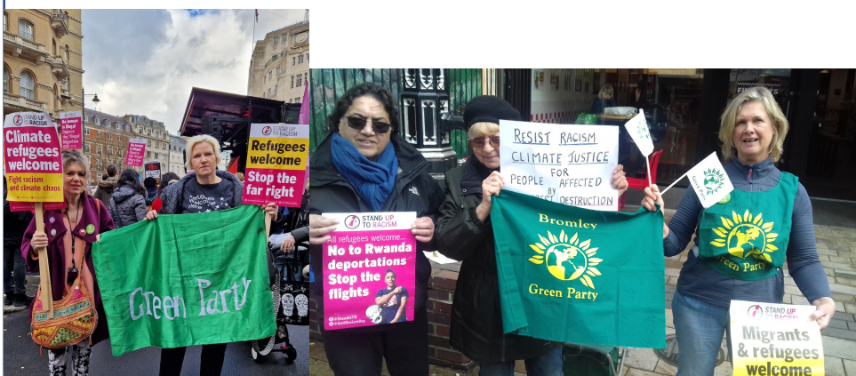
Some members of Bromley Green Party joined the London march and rally, and others held a vigil in Bromley Market Square.

Bromley Green Party members also joined a vigil in Bromley Market Square, with Bromley Friends of the Earth and Peace Council. The main message on their placard was 'Climate Justice for people affected by rainforest destruction' emphasising the way in which corporations are profiting at the expense of marginalised indigenous people, and the impact on climate change.